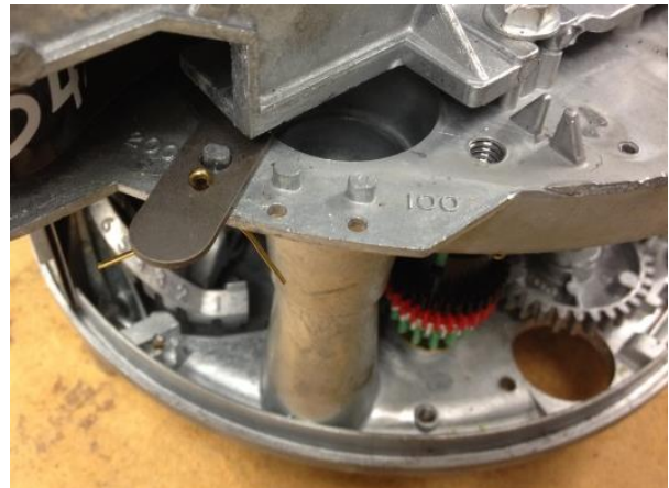
Move the Dollar Shift Lever to the "200" position (the Left most stud). Photo of shift lever in correct position