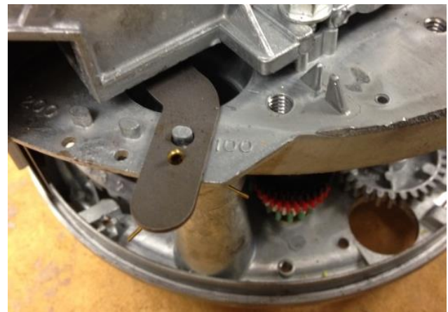
Dollar Shift Lever in the "100" position Photo of shift lever in correct position