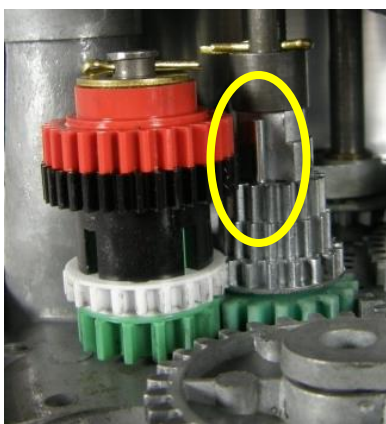
Vertical Pin in Place - Wrong!