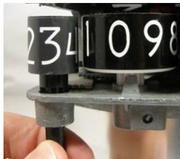
Dollar Price Wheel set for $3.000 - $3.999