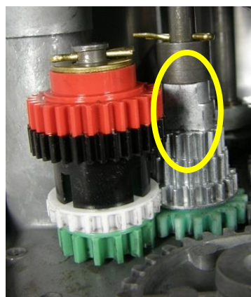
Vertical Pin Removed - Right!

All product or company's names, trade names, trademarks, parts numbers and part descriptions may be the trademarks of their respective owners, and are used for reference or identification purposes only. PMP does not claim any right to or affiliation with such owners. The PMP product described here is manufactured or remanufactured and sold by PMP and is not the product of any other identified manufacturer.