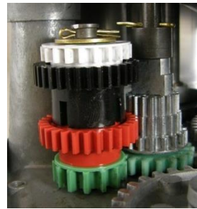
$4.000 - $4.999 Configuration