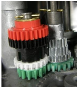
$3.000 - $3.999 Configuration