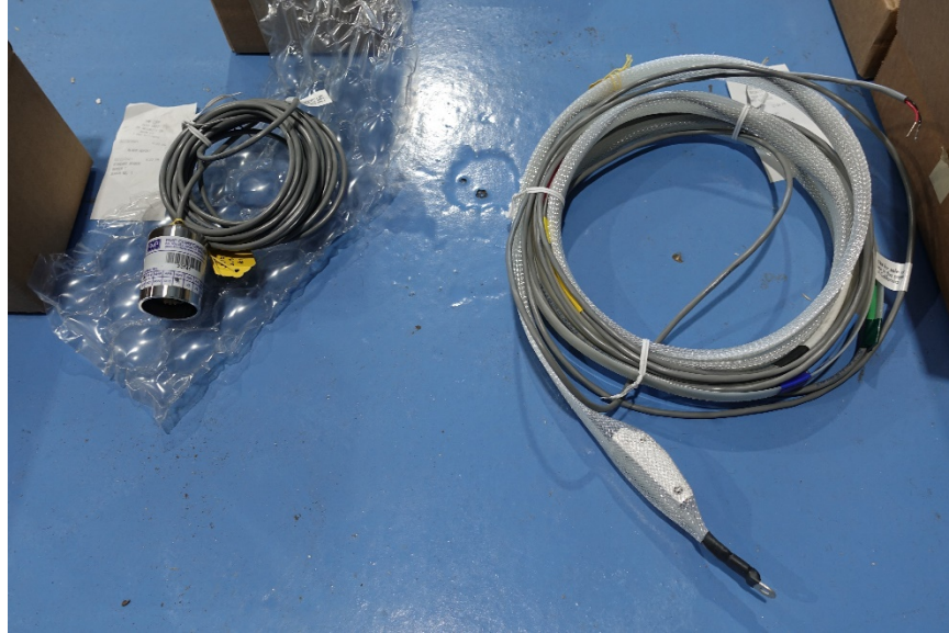
Photo #1: PMP Units #63510 ULS Steel Tank Interstitial Sensors and #63520 HFS Fiberglass Tank Interstitial Sensors

Solution Engineering Group (SEG) was asked by PMP Corporation (PMP) to conduct testing on two Liquid Level Sensors with float switches to determine the lower level detection limit of the sensors. As part of this effort, SEG was asked to render its opinion as to if these sensors qualify as “a simple apparatus.”