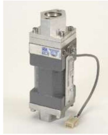
22048 & 22049