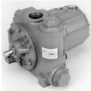
22010 & 22012