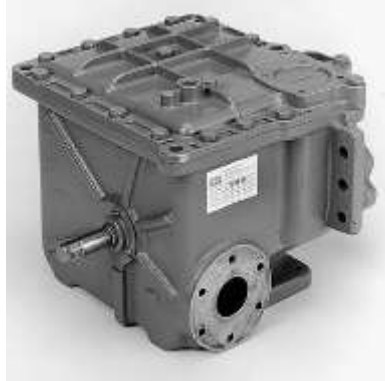
26019, 26021, 26022, 26023