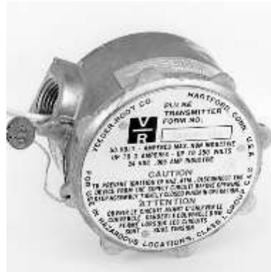
47110 & 47111