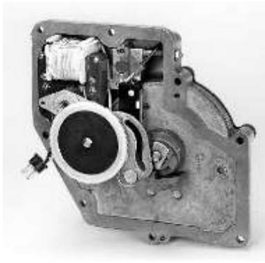
38006-4, -5, -6, 38007-4, -5, -6