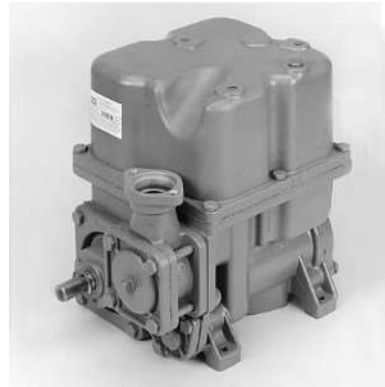
21008 & 21010