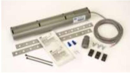
62208 & 62209