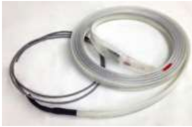
62401, 62404, 62407 & 62409