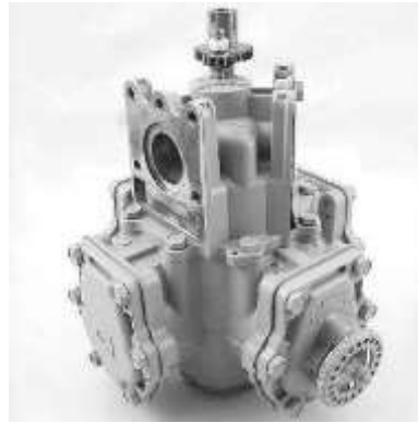
2025 & 22026