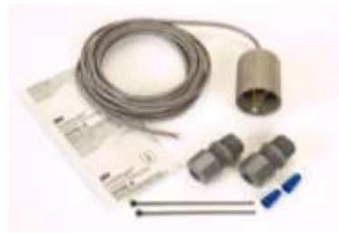
62420 & 62460