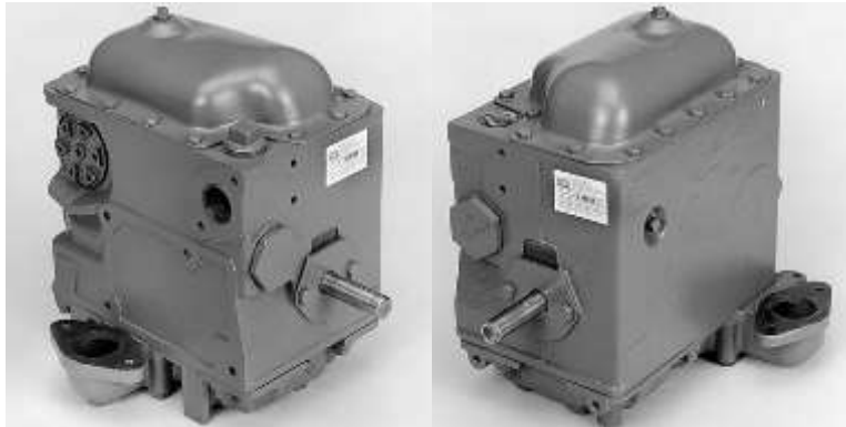
25100, 25101 & 25104