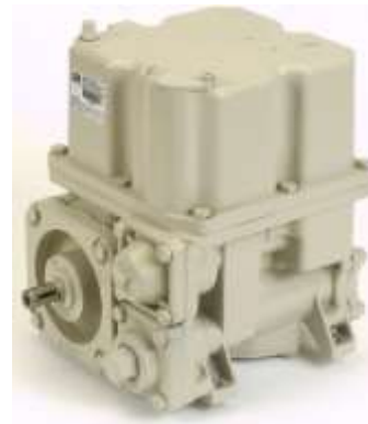
22018 & 22036