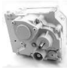
28040, 28041, 28042 & 28043