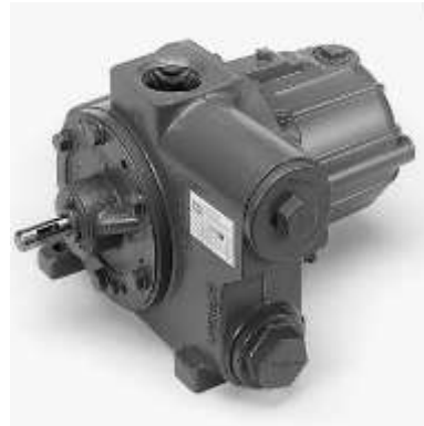
22013 & 22014