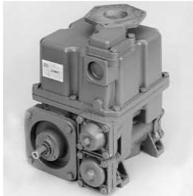
21011, 21012, 21014 & 21015