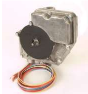
38010-5 & 38011-9