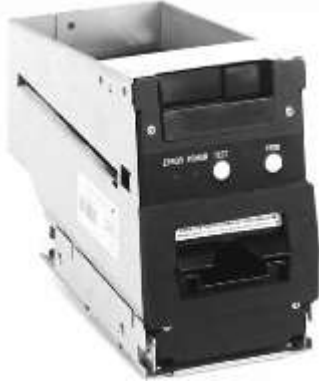
68612 & 68613