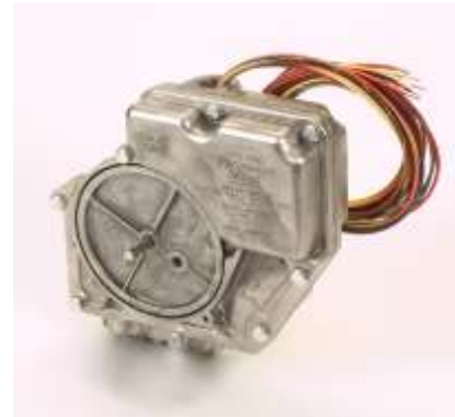
38012-6 & 38013-10