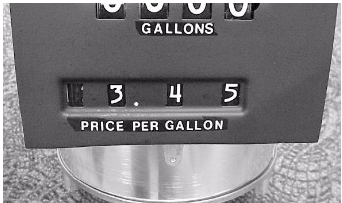
Example of Price-Posting Wheels Showing $3.45

All product or company's names, trade names, trademarks, parts numbers and part descriptions may be the trademarks of their respective owners, and are used for reference or identification purposes only. PMP does not claim any right to or affiliation with such owners. The PMP product described here is manufactured or remanufactured and sold by PMP and is not the product of any other identified manufacturer.