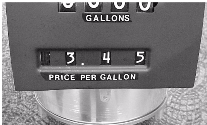
Example of Price-Posting Wheels Showing $3.45 (Leftmost (Small) Wheel is in the “Blank” Position)