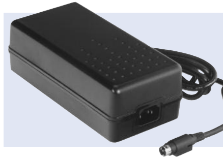
Topaz™ Power Supply

DC power cord connected to case DC connector — DB15