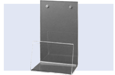
Power Supply Wall Bracket

DC power cord removable DC power cord not included DC connector — round 14-pin DIN