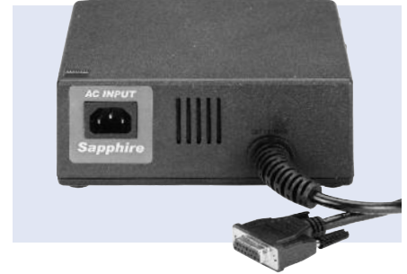
Sapphire® Power Supply

DC power cord connected to case DC connector — DB15