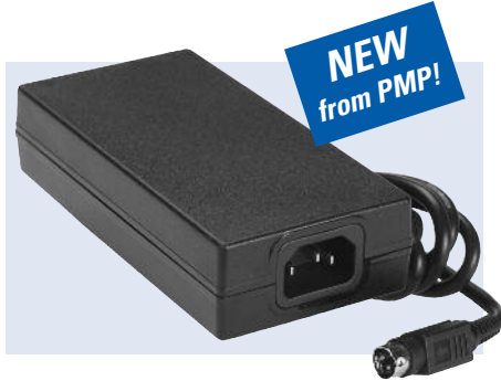
PS-180 Power Supply