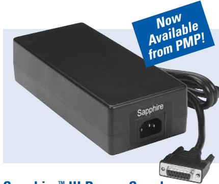
Sapphire™ III Power Supply

A separate power supply for VeriFone® 950 printers. See back page.