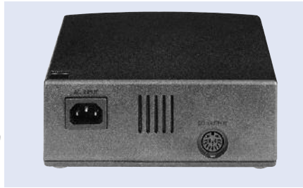
Ruby™ Power Brick

DC power cord connected to case DC connector — round 3-pin DIN