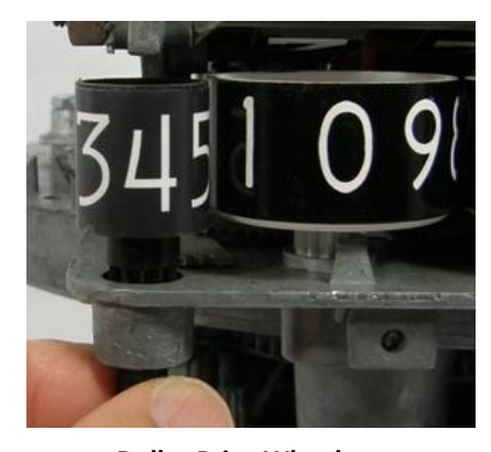
Dollar Price Wheel set for $4.000 - $4.999