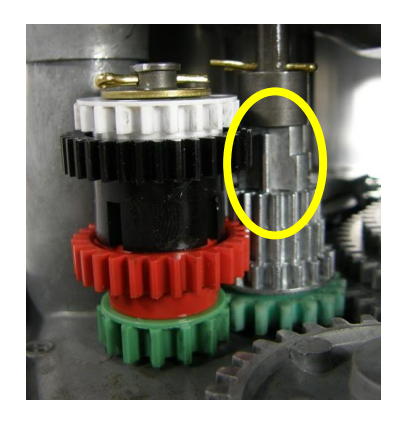
Vertical Pin in Place -Wrong!

2) Check to ensure the dollar drive shaft vertical pin has been removed. If your computer was set for $4.000 - $4.999 pricing and operated properly, this pin will have already been removed and no action is necessary.