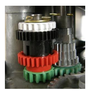
$4.000 - $4.999 Configuration