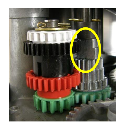
Vertical Pin Removed -Right!

All product or company's names, trade names, trademarks, parts numbers and part descriptions may be the trademarks of their respective owners, and are used for reference or identification purposes only. PMP does not claim any right to or affiliation with such owners. The PMP product described here is manufactured or remanufactured and sold by PMP and is not the product of any other identified manufacturer.