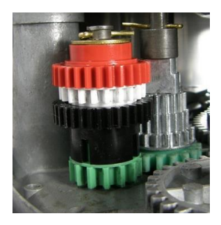
$5.000 - $5.999 Configuration