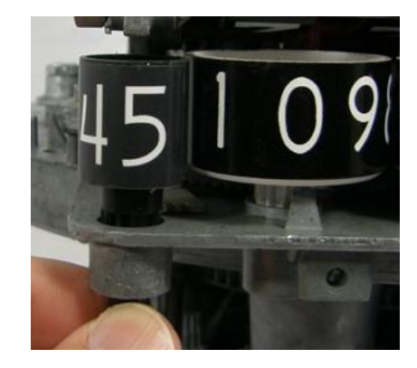
Dollar Price Wheel set for $5.000 - $5.999

All product or company's names, trade names, trademarks, parts numbers and part descriptions may be the trademarks of their respective owners, and are used for reference or identification purposes only. PMP does not claim any right to or affiliation with such owners. The PMP product described here is manufactured or remanufactured and sold by PMP and is not the product of any other identified manufacturer.