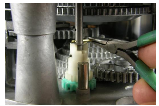
E. Remove the cotter pin from the dollar drive shaft.