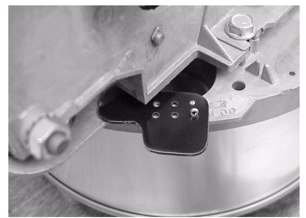
Lever position for $2.000 to $2.999 on a 4203 computer