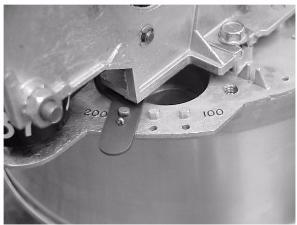
Lever position for $2.000 to $2.999 on a 2002E computer

If your computer was set to a price between $3.000 & $3.999, and was functioning properly, the range lever will already be set appropriately and no adjustment is necessary!