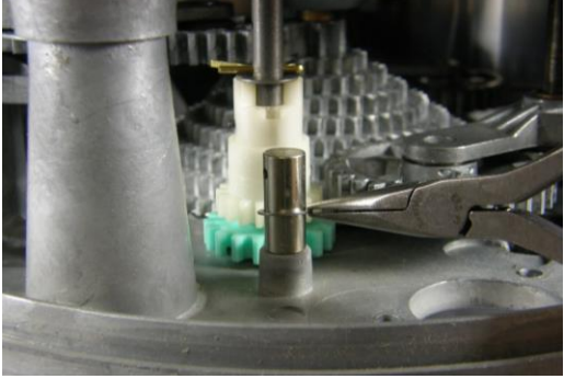
D. Remove and save the bottom washer which has an outer diameter of 5/16".

B. Remove and save the top washer which has an outer diameter of 5/8".