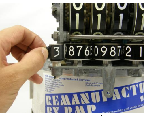
G. Reseat the washer on top of the gear and reinsert the cotter pin.