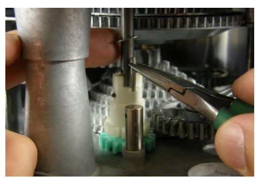
F. Slide the washer up the dollar drive shaft and insert the dollar drive shaft vertical pin (you will need to rotate the gear to get the pin to seat into the bottom gear).