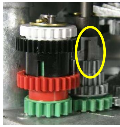
Vertical Pin in Place - Wrong!

If your computer was set for $4.000 - $4.999 pricing and operated properly, this pin will have already been removed and no action is necessary.