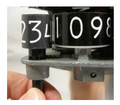
Dollar Price Wheel set for $3.000 - $3.999

All product or company's names, trade names, trademarks, parts numbers and part descriptions may be the trademarks of their respective owners, and are used for reference or identification purposes only. PMP does not claim any right to or affiliation with such owners. The PMP product described here is manufactured or remanufactured and sold by PMP and is not the product of any other identified manufacturer.