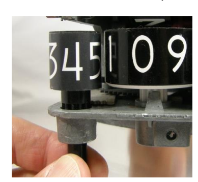
Dollar Price Wheel set for $4.000 - $4.999