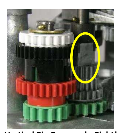
Vertical Pin Removed - Right!

All product or company's names, trade names, trademarks, parts numbers and part descriptions may be the trademarks of their respective owners, and are used for reference or identification purposes only. PMP does not claim any right to or affiliation with such owners. The PMP product described here is manufactured or remanufactured and sold by PMP and is not the product of any other identified manufacturer.