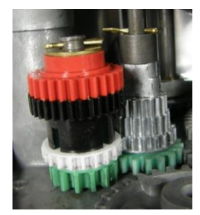
$3.000 - $3.999 Configuration