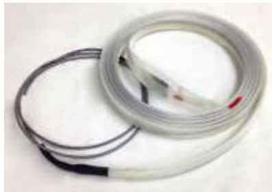
62401, 62404, 62407 & 62409