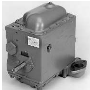
25102, 25105 & 25107