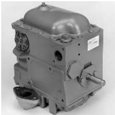
25100, 25101 & 25104