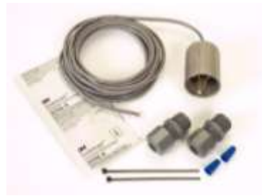
62420 & 62460