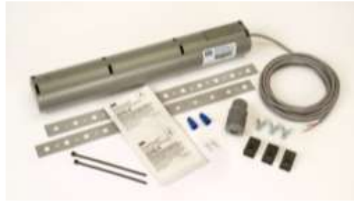
62208 & 62209