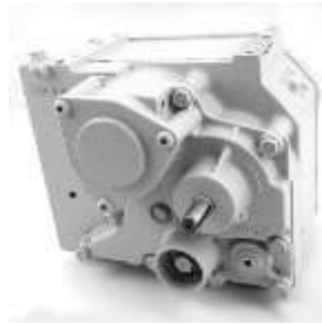
28040, 28041, 28042 & 28043