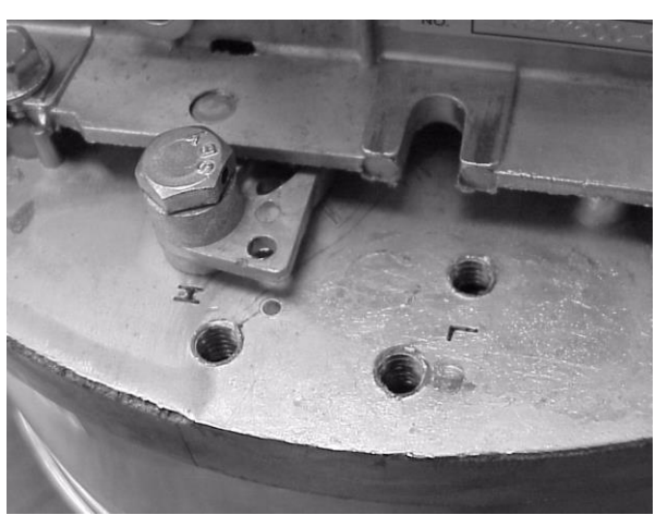
Price Range Shift Lever in "H" Position