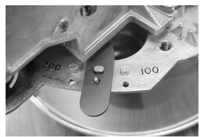
Dollar Shift Lever in Central Position