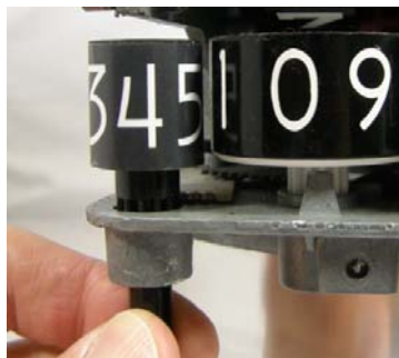
Dollar Price Wheel set for $4.000 - $4.999