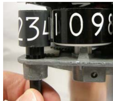
Dollar Price Wheel set for $3.000 - $3.999