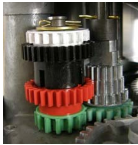
$4.000 - $4.999 Configuration