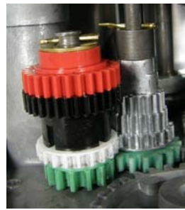
$3.000 - $3.999 Configuration