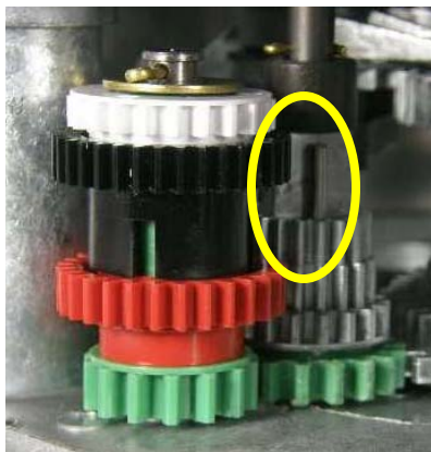
Vertical Pin in Place -Wrong!

If your computer was set for $4.000 - $4.999 pricing and operated properly, this pin will have already been removed and no action is necessary.