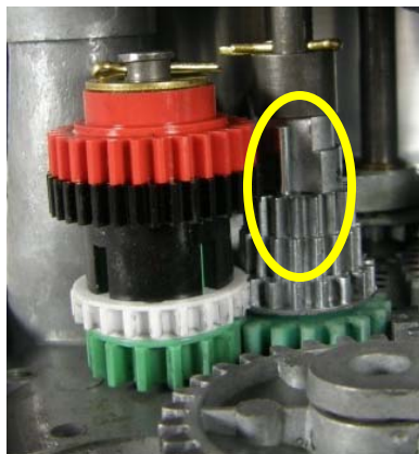
Vertical Pin in Place -Wrong!

If your computer was set for $3.000 - $3.999 pricing and operated properly, this pin will have already been removed and no action is necessary.