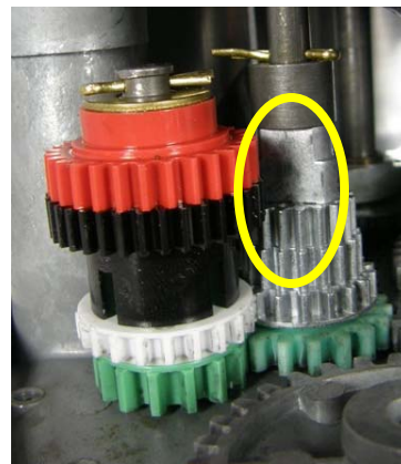
Vertical Pin Removed -Right!