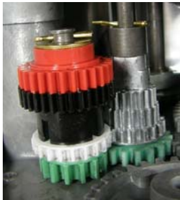
$3.000 - $3.999 Configuration