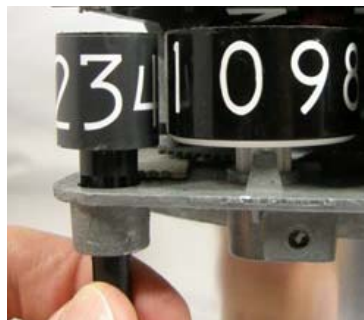
Dollar Price Wheel set for $3.000 - $3.999