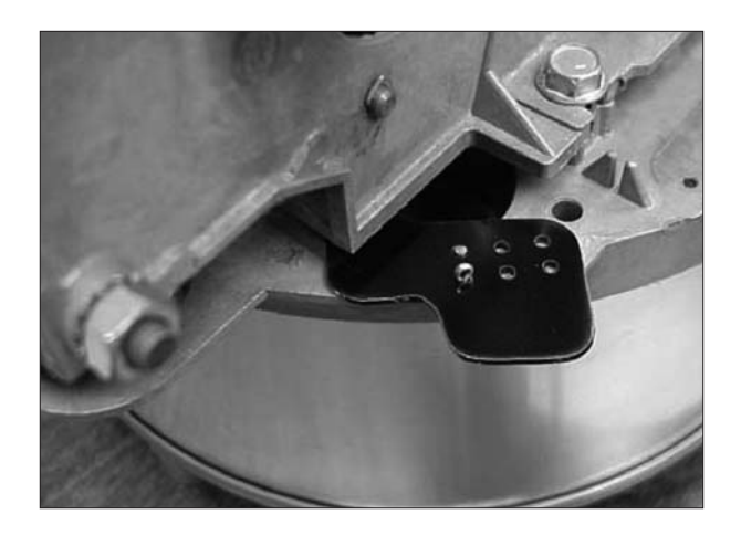
$1.000 to $1.999 position 4203