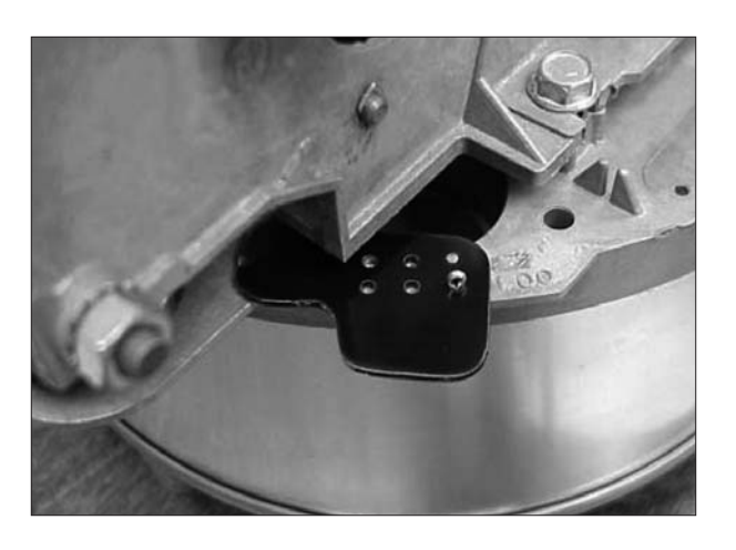
$2.000 to $2.999 position 4203