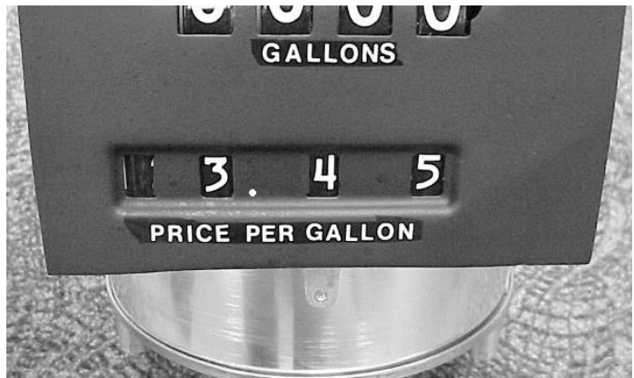
Example of Price-Posting Wheels Showing $3.45

All product or company's names, trade names, trademarks, parts numbers and part descriptions may be the trademarks of their respective owners, and are used for reference or identification purposes only. PMP does not claim any right to or affiliation with such owners. The PMP product described here is manufactured or remanufactured and sold by PMP and is not the product of any other identified manufacturer.