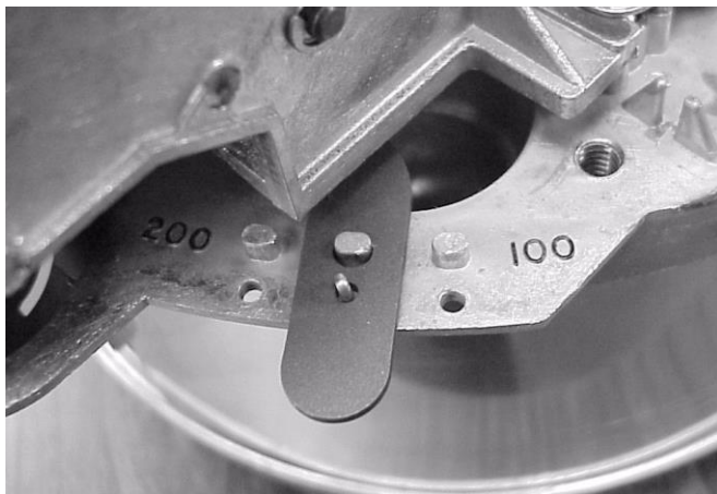
Dollar Shift Lever in Central Position