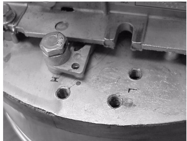
Price Range Shift Lever in “H” Position